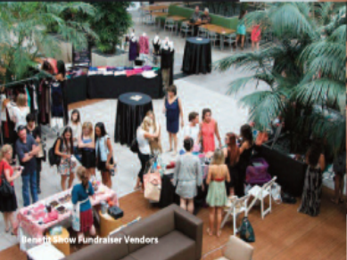
Research Show Fundraiser Vendors