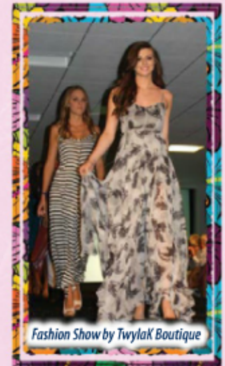
Fashion Show by TwylaK Boutique